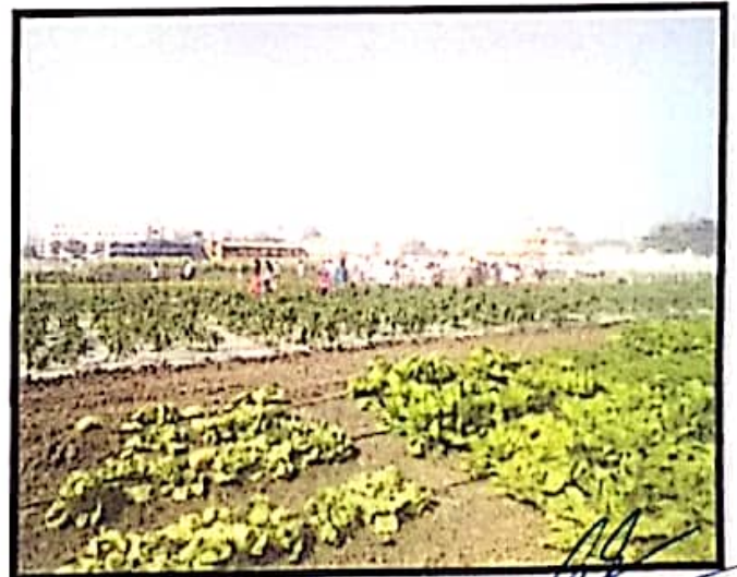
visit to Bisosheetal (kalash) seed company at Jalna.

PRINCIPAL Nutan Mahavidyalaya SELU, Dist. Parbhani